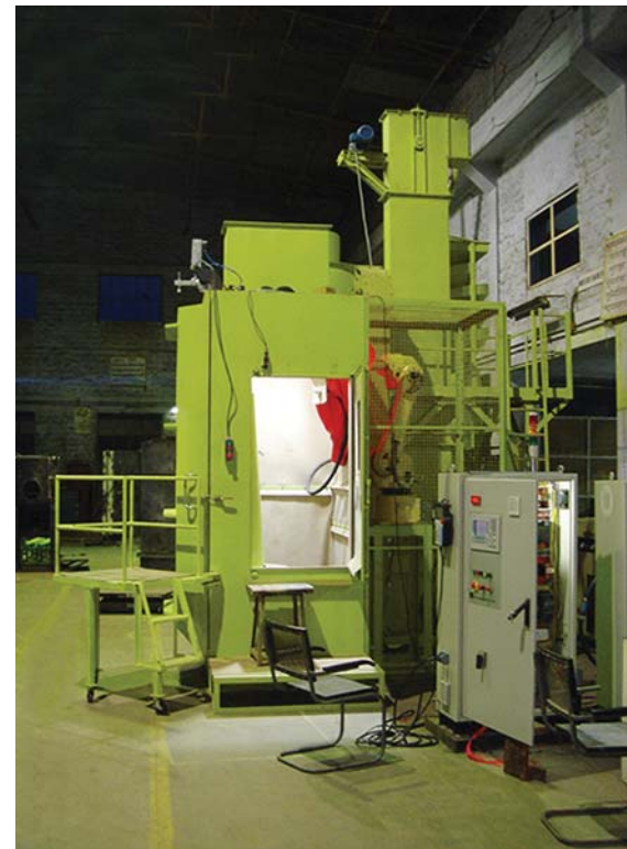
Mec Shot Robotic Shot Peening Machine for Turbine Blades

The peening intensity range using cast steel shot S390/S280 is 0.30 to 0.35 at