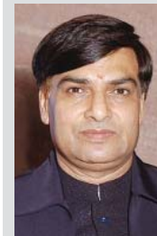
Author: Anand Modi Managing Director

classification, storage and shot peening system. Close loop air pressure regulator for regulating air pressure through PLC & Magna Valve was supplied for controlling variable flow rate through PLC. To protect the Magna Valve against excessive wear, there was a Pinch Valve above the Magna Valve. The shot flow controller was with digital display.